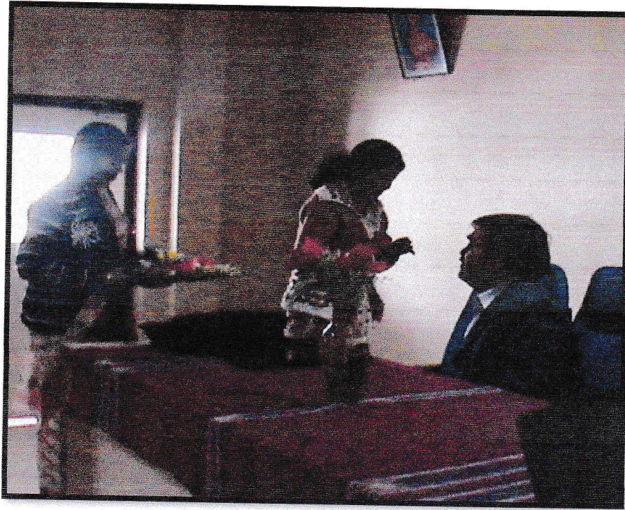
FELICITATION OF THE SPEAKER